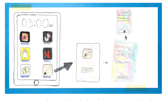
FIGURE 1. Sixth-graders' interface design of the voice recognition based "Watchman" app, which they designed for recognizing and reporting to teacher which kids make noise when the teacher leaves the room [111].

for students [21], [36]. In one series of ML workshops, middle-school children's project ideas included, for example, an app that identifies edible mushrooms and warns about poisonous ones, an app that helps color blind people to identify colors, and an app that recognizes cheerleader poses to help training [98], [111]. Figure 1 shows children's interface design for an app that used speaker recognition to report to the teacher which kids make the most noise when the teacher was away [111] (that app, ideated by children, also serves as a good example case with which to discuss AI ethics.)