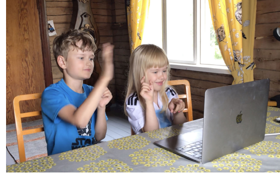
FIGURE 5. A preschooler and older brother studying at home, creating a model to recognize gestures [110] (GDPR compliant photo).

A number of ML education tools do not require exposure to the concept of algorithmic steps—on the contrary, some celebrate the shift from "coding to teachable machines" [15]. In training a model, in testing a model, and in connecting the model with actions, there is less a need for thinking about