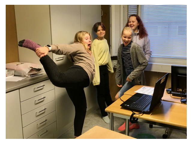
FIGURE 4. Twelve-year old children training an ML model to recognize cheerleader poses [111] (GDPR compliant photo).

opportunities for bodily interaction and natural language [16], [36], [37], [48], [102], [110]. For example, educational technology for learning ML principles allowed children to train PoseNet-based ML models to recognize different cheerleader poses (Fig. 4) [111].