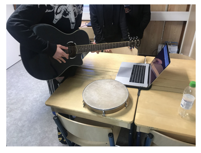
FIGURE 2. Ninth-grade students recording samples of musical instruments they wanted their ML app to recognize [111].

Instead of relying on explicitly hand-coded rules that a computer will follow on different inputs, many ML initiatives guide students to train ML models by giving the system a lot of data to learn from [21]. Studies have used drawings, poses, speech, and video [59], [111], as well as data from, for